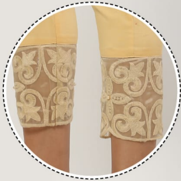
Tissue Embroidery with Matching Pearl