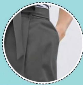
Both Side Pocket