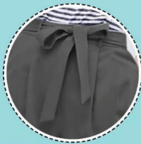
Full Length Belt for Perfect Knot