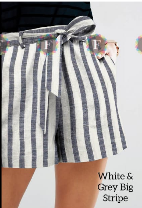
White & Grey Big Stripe