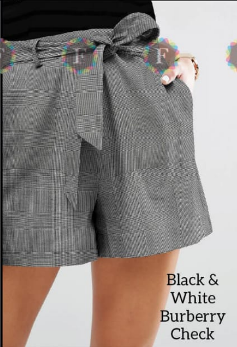
Black & White Burberry Check