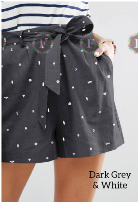
Dark Grey & White