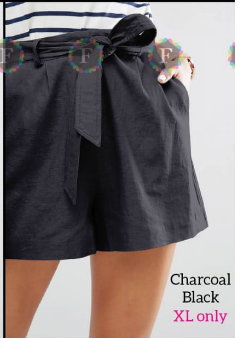
Charcoal Black XL only