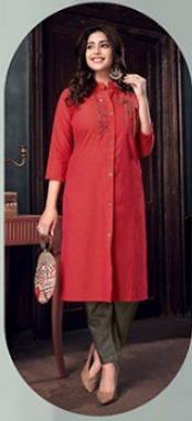
DESIGN NO : - 2825