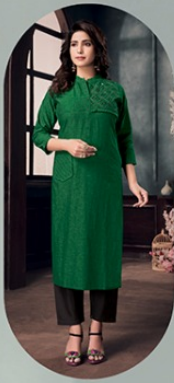
DESIGN NO : - 2822