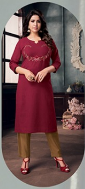
DESIGN NO : - 2823