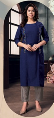
DESIGN NO : - 2828