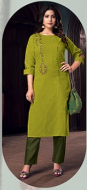
DESIGN NO : - 2824