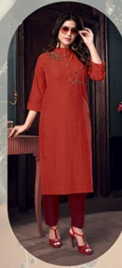
DESIGN NO : - 2827