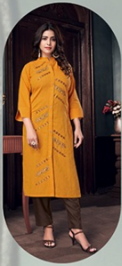
DESIGN NO : - 2821