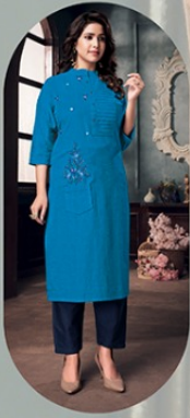
DESIGN NO : - 2826